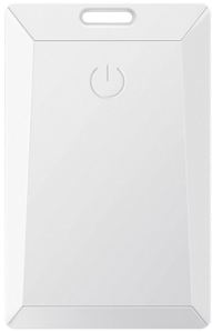
85mm x 5.2mm x 54mm